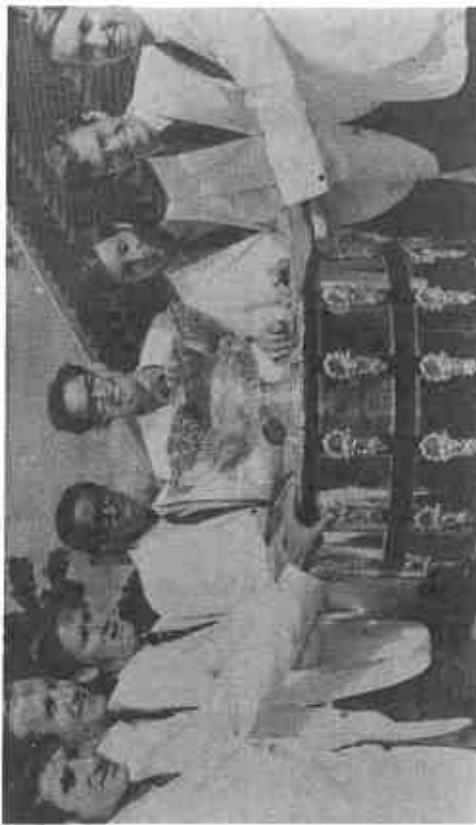
EIGHT FORMER COLLEGIATE ALL-AMERICANS comprise this photo of the 1988 victorious U.S. Davis Cup squad (4-1 winner over Australia in Challenge Round). L-R, Charles Pasarelli, Stan Smith, Coach Dennis Ralston, Arthur Ashe, Clark Graebner, Bob Lutz, Jim Osborne, Captain Donald Dell.